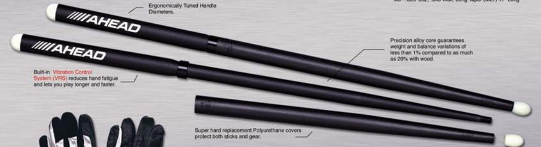
M1 - 695 Dia., .040 Wall, Short Taper (MST) 16 1/4" Long M2 - 695 Dia., .040 Wall, Long Taper (MLT) 16 3/4" Long M3 - 695 Dia., .040 Wall, Long Taper (MLT) 17" Long