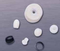
Super high impact nylon tips come in different shapes (including mallet heads) to fit every style of play.