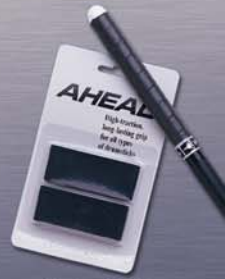
Ahead grip tape offers the best feel and durability.

AHEAD OFFERS A VARIETY OF HIGH PERFORMANCE ACCESSORIES DESIGNED FOR TODAY'S DRUMMERS