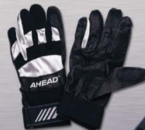
Ahead drumming gloves feature "hotspot" pads for longer life.