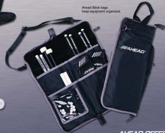
Ahead Stick bags keep equipment organized.